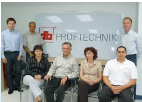
PRÜFTECHNIK Team Montreal, Canada